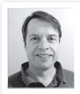
WIES FRAC Président tournoi • Tournament Chairman